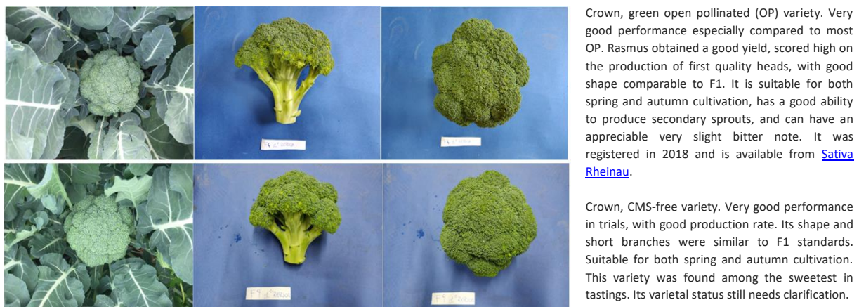
Figure. 2: Rasmus (top) and CN-bro-09 (bottom) were tested alongside commercial and local materials.

In broccoli, the two selected genotypes performed well in the different locations. The non-CMS variety CN-Bro-09 performed well in most trials and obtained results similar to F1 references. It is a good alternative to CMS varieties. The open pollinated variety Rasmus was also appreciated in several locations, with high yields (sometimes similar or higher to CN-bro-09) and yield in general exceeding other tested lines (other than the F1 references). It was especially appreciated by the farmer in Portugal for its ability to produce secondary heads. Under certain conditions, Rasmus had less homogeneous heads and a higher proportion of unmarketable yield compared to CN-Bro-09. Both test varieties are recommendable for organic production of broccoli. Rasmus and CN-bro-09 performed differently depending on location. In Italy and France, these varieties were evaluated as less good than available standard varieties on the market. In general, CN-Bro-09 was the most appreciated. The status of CN-Bro-09 needs clarification at the moment. We know that it is free of cytoplasmic male sterility but have no additional information from the seed provider. The results show, that even within the current strict market requirements, good alternatives to CMS-varieties exist.