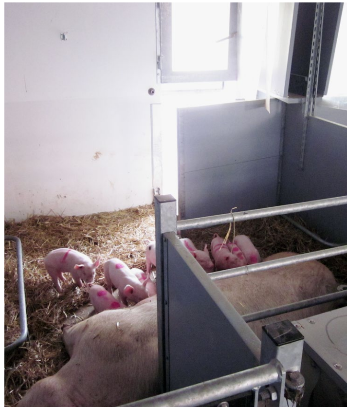
Picture 10.2: Using windbreaks and plastic curtains can help to prevent drafts in the farrowing pen.