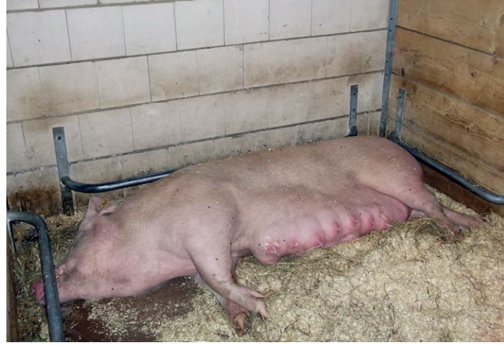
Picture 10.1: Keep-off rails create a save space for piglets when the sow is lying down and therefore help to reduce piglet crushing.

Layout example of a farrowing pen consists of different areas. The lying area provides space for the sow to rest, feed and move around. It should have at least 4 m 2 , so that the sow can turn around. Before farrowing adding some extra long straw to the lying area, is recommended, so the sow can use this bedding material for nest building. The piglet nest should be heated, as piglets need a higher ambient temperature compared to the sow. The outdoor run is used for exercise, resting, dunging and rooting.