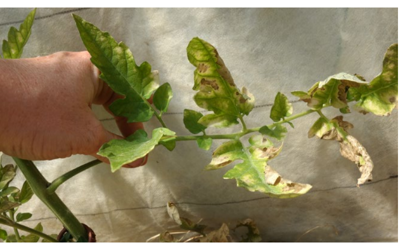
Photo 3: Leaf burning due to gas emissions on young tomato plants. Source: Patricia Schwitter, FiBL.

Photo 1 and 2: Nitrogen deficiency symptoms on young tomato plants due to reduced soil temperature under the mulch layer and subsequent delayed nutrient mineralisation. Source: Patricia Schwitter, FiBL.