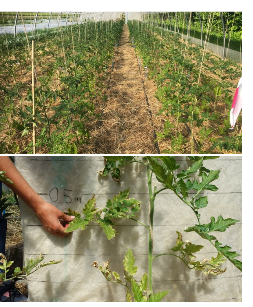
Photo 1 and 2: Nitrogen deficiency symptoms on young tomato plants due to reduced soil temperature under the mulch layer and subsequent delayed nutrient mineralisation.