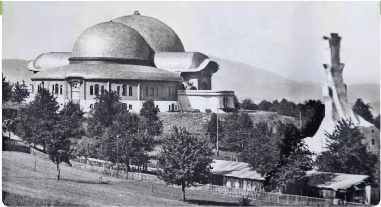
The first Goetheanum, in Dornach, Switzerland, pictured on a postcard circa 1920.