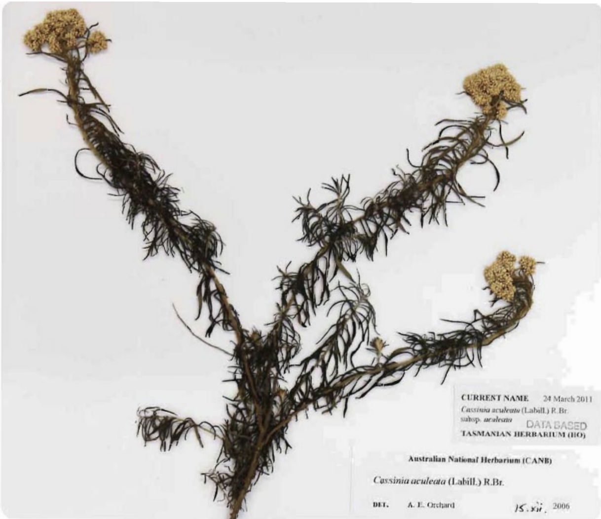
Botanical specimen collected by Alfred Meebold, 1936, Warrandyte, Victoria.