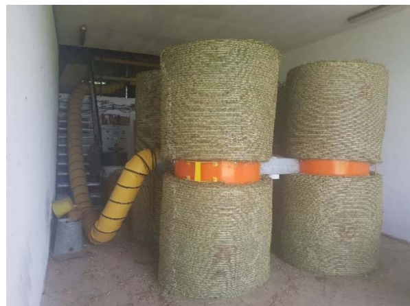
Figure 6: Ventilation of bales.