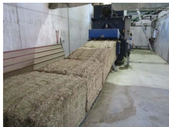
Figure 4: The crop is compressed into bales.