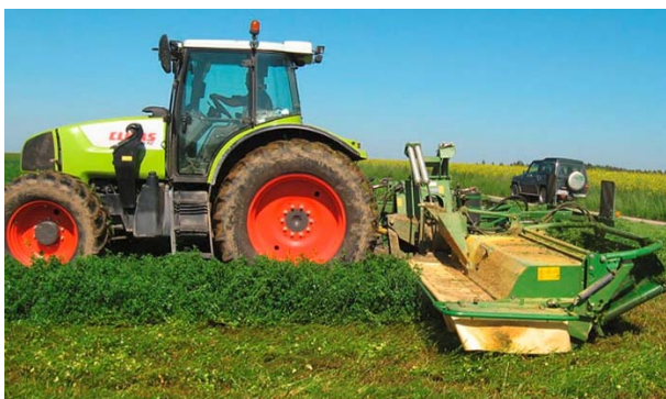
Figure 1: Mowing of fine-grained legumes.

mostly used for ruminant feeding, but can now also be used for monogastric feeding due to higher nutrient concentrations