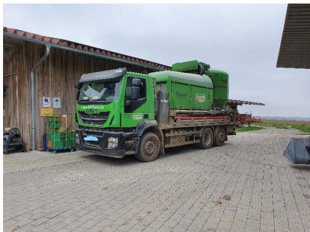
Figure 5: Mobile grinding and mixing plant.