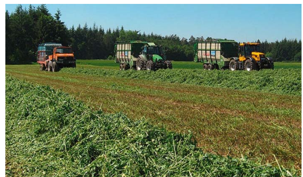
Figure 2: Fine-grained legumes are brought in moist.