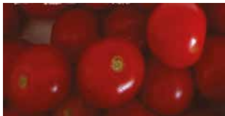
Figure 1. Tomatoes of 'Cher Ami' variety

The organic crop of tomatoes ('Cher Ami' and 'Coeur de Boeuf' varieties) were cultivated in hi-tech glass greenhouse using the PRIVA program for the greenhouses. The planting was started in March 2018. The plants were not grafted and were used only hybrids.