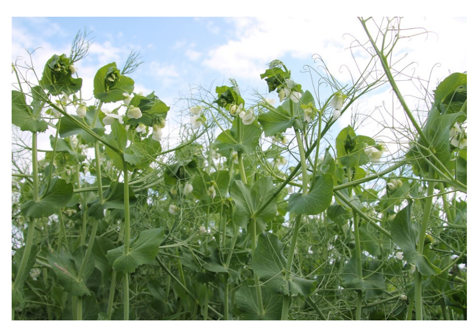
A pea crop as an example of an underutilised protein feedstuff in organic and low-input dairy production.

Organic and low-input farms typically rely on farm-produced feeds, particularly grazed and conserved forages. Supply chain stakeholders are particularly interested in improved protein supply to cows and in alternatives to imported soya (Nicholas et al., 2014). Proposed solutions ranged from increasing the protein content of swards, promoting the production of grain legumes, and using industrial by-product feeds. A major challenge in considering new feed solutions is to buffer periods of feed shortages due to effects of variable weather conditions on homegrown forage. A Decision Support System was developed (Baldinger et al., 2015) to demonstrate the variability of forage production and possible reactions (https://zalf-lse. github.io/solid-dss/; Baldinger et al., 2015).