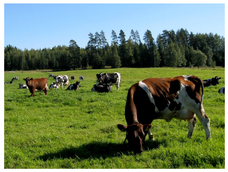
The large variability in the genetic merit of breeding animals allows for the selection of animals that are suitable for individual herds or farms.