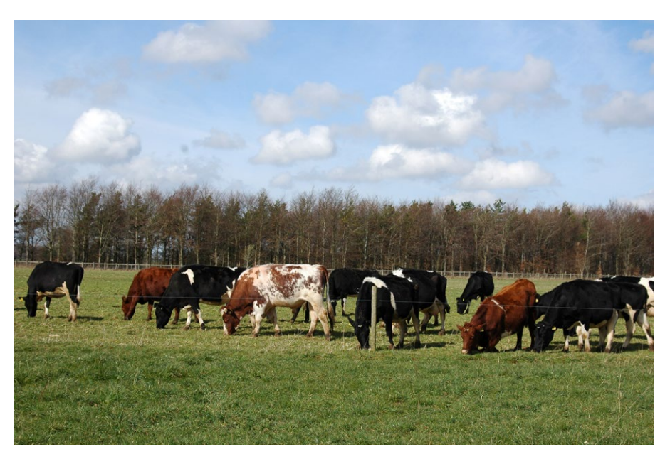
Mob grazing cattle in UK participatory case study.

genotypes? A key SOLID objective was to compare commonly used breeds with breeds perceived by farmers and industry actors as being 'better adapted' to specific conditions within countries and regions. Low-input production systems require a cow that is resilient i.e. can consume large quantities of forage per unit body weight, efficiently convert this forage into high value milk, become pregnant within a defined breeding season, and has a high health status. High-yielding