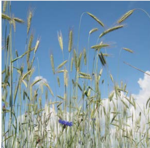
Geographical distribution of challenging weed species