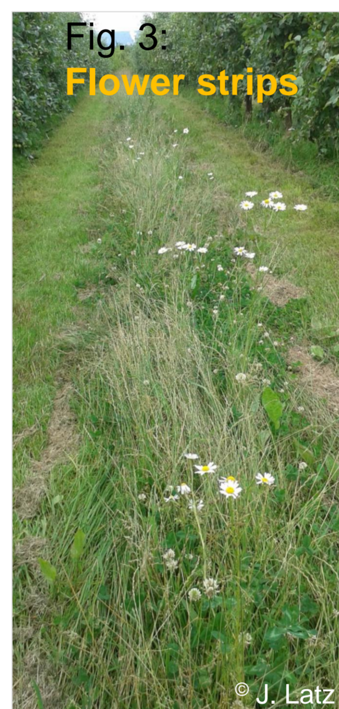
Fig. 3: Flower strips