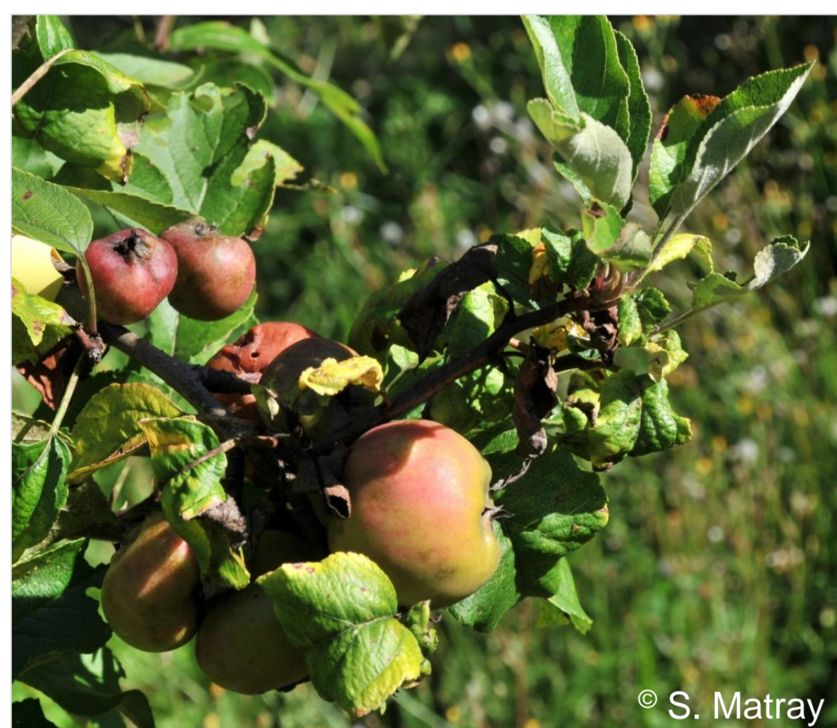
Fig. 5: D. plantaginea damage on leaves and apples.