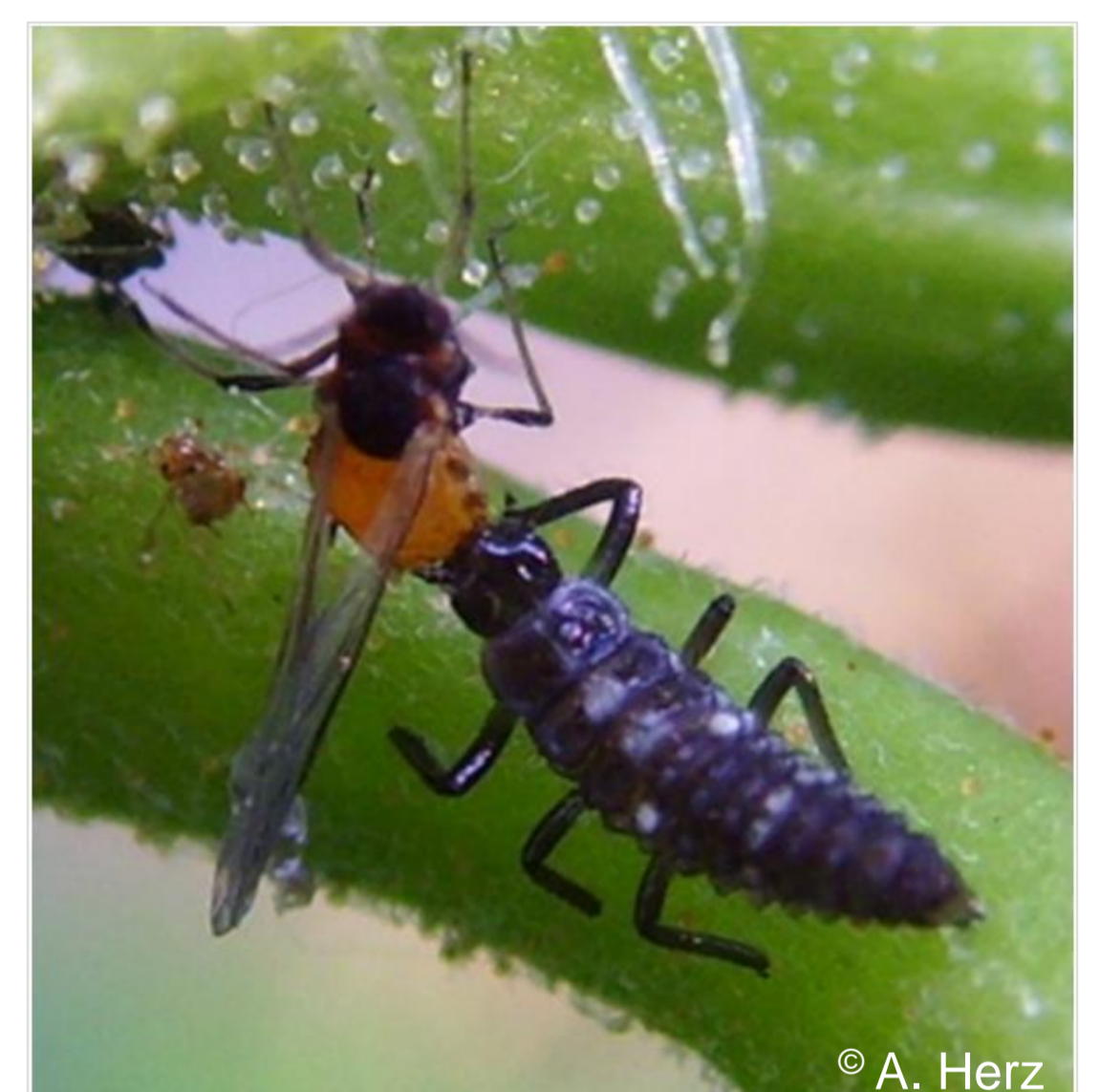
Fig. 9: Larva of Coccinellidae at work.