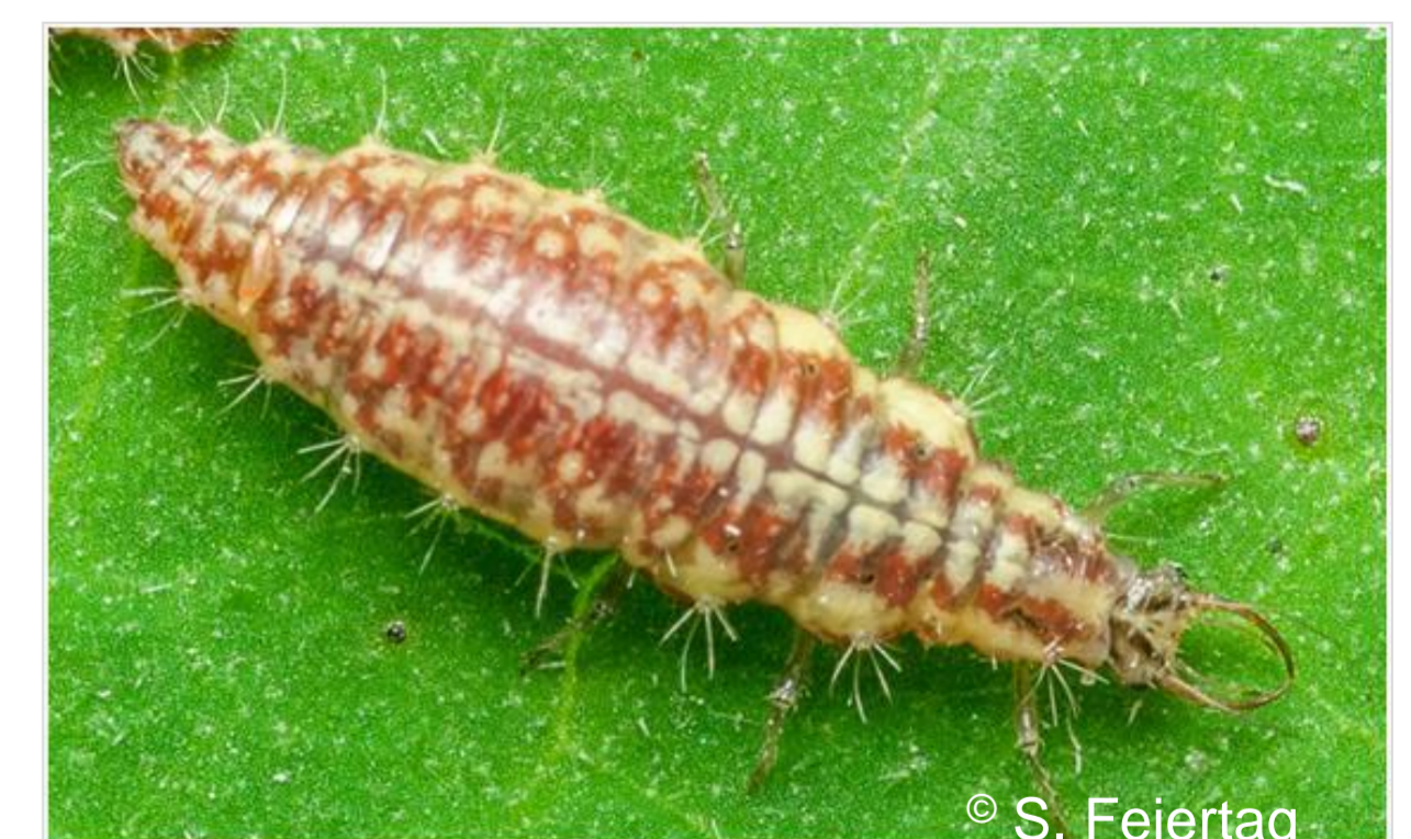
Fig. 10: Larva of Chrysoperla carnea