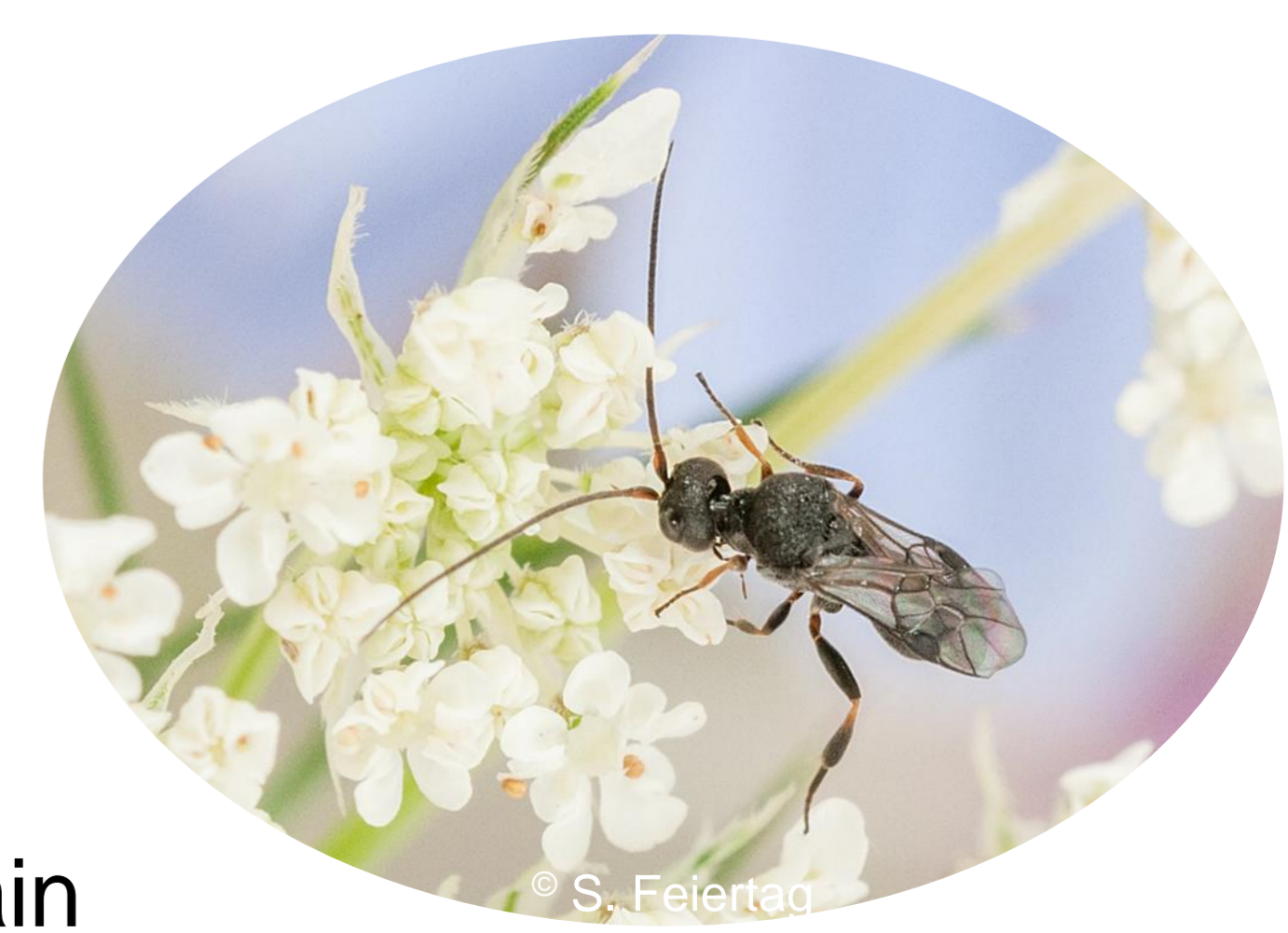
Fig. 11: Ascogaster quadridentata on Daucus carota .