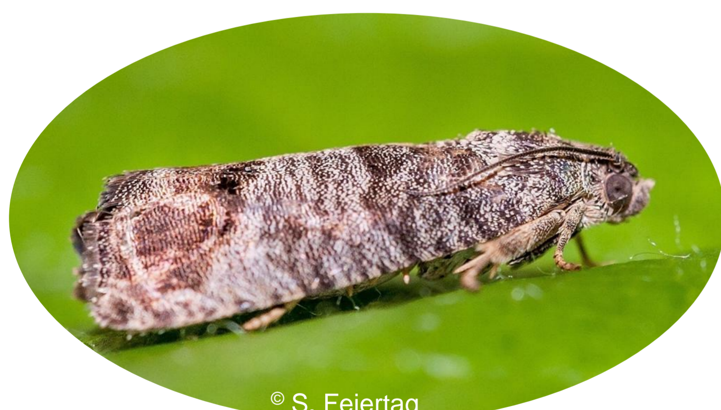
Fig. 6: Cydia pomonella