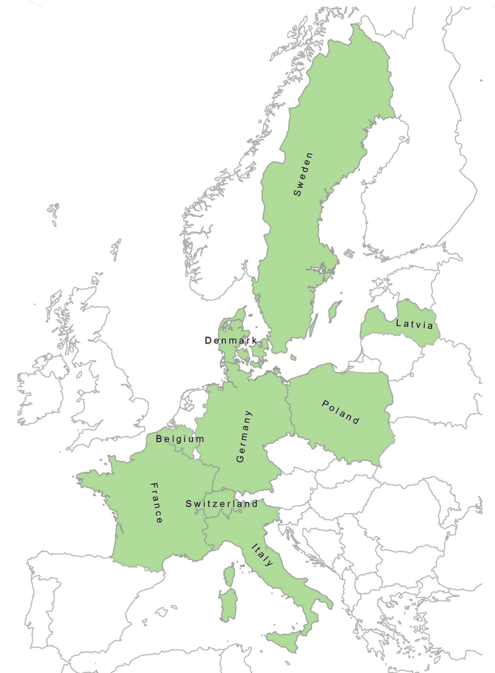
Fig. 1: Contributing countries, Map: ArcGIS

Universities, research institutes, advisory services and collaborating farmers of nine European countries (Figure 1). This project is funded by the COREorganic Plus Program of the EU and national funding bodies for three years (2015 - 2017).