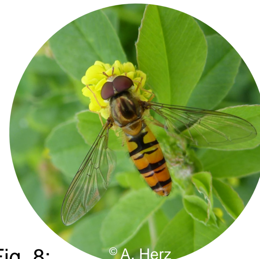
Fig. 8: Episyrphus baleatus on Medicago lupulina .