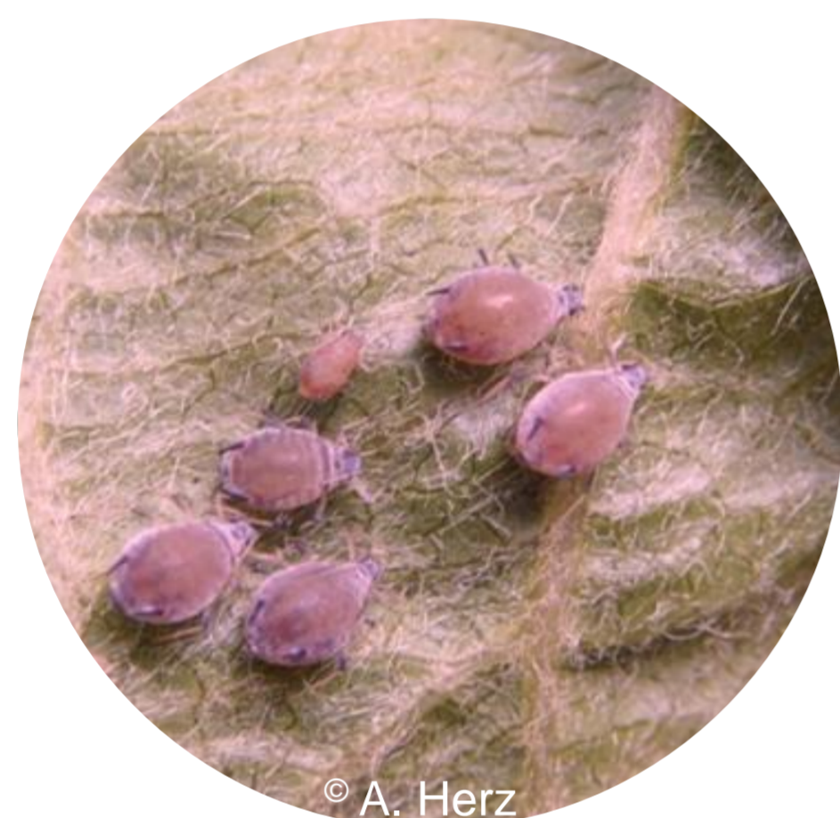
Fig. 4: Dysaphis plantaginea