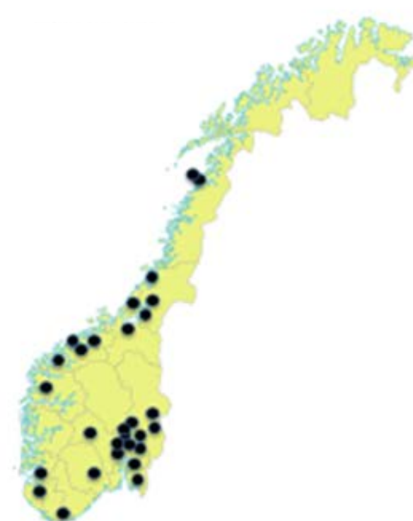
Figure 2: Tentative map showing the geographical distribution of Norwegian CSAs. Guttulsrød M., OIKOS.