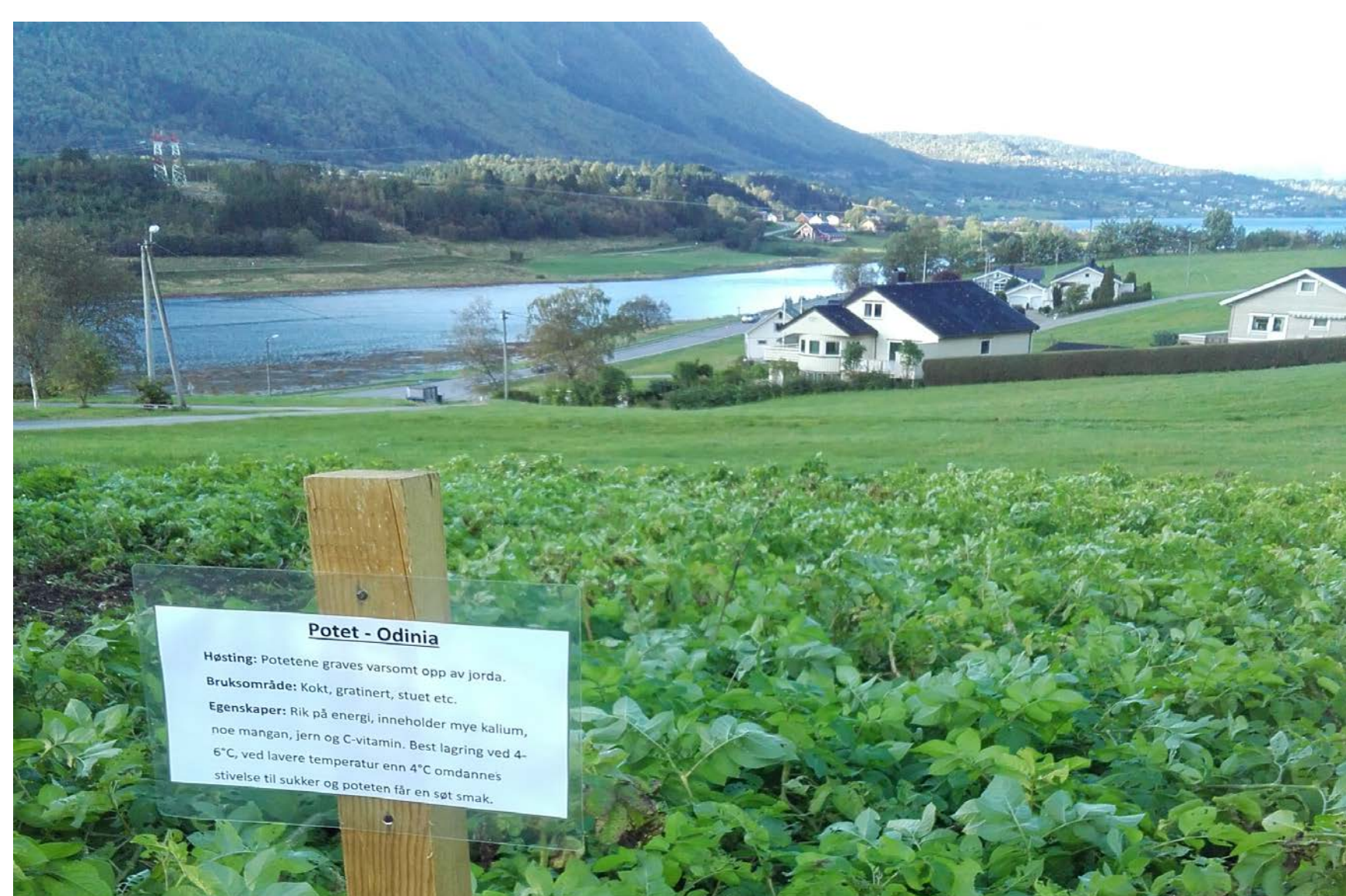
Photo 1: Crops with information about harvesting, use and storing. M. Grøtta.

The Scandinavian countries hold rather ambitious national plans for implementation of organic farming. The governments justify this because it can be part of sustainable development. The national Action Plan in Norway is aiming for 15 % organic production and consumption in 2020. The big number of CSAs in Norway, all organic, is exceptional; Denmark counts for one, Finland for eight and Sweden for a dozen CSAs (Roisin, 2016).