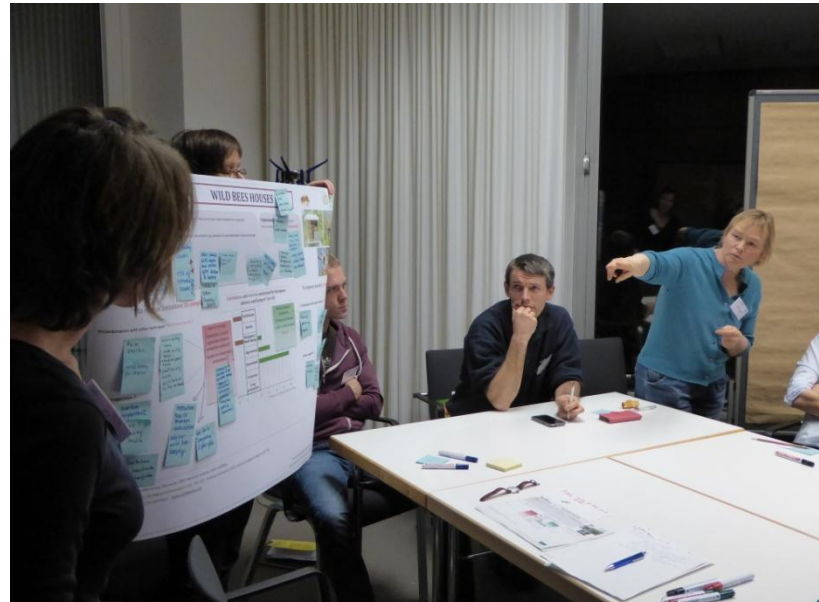
Workshop: Enhancement of Functional Biodiversity, 17th ecofruit-conference, 16.02.16