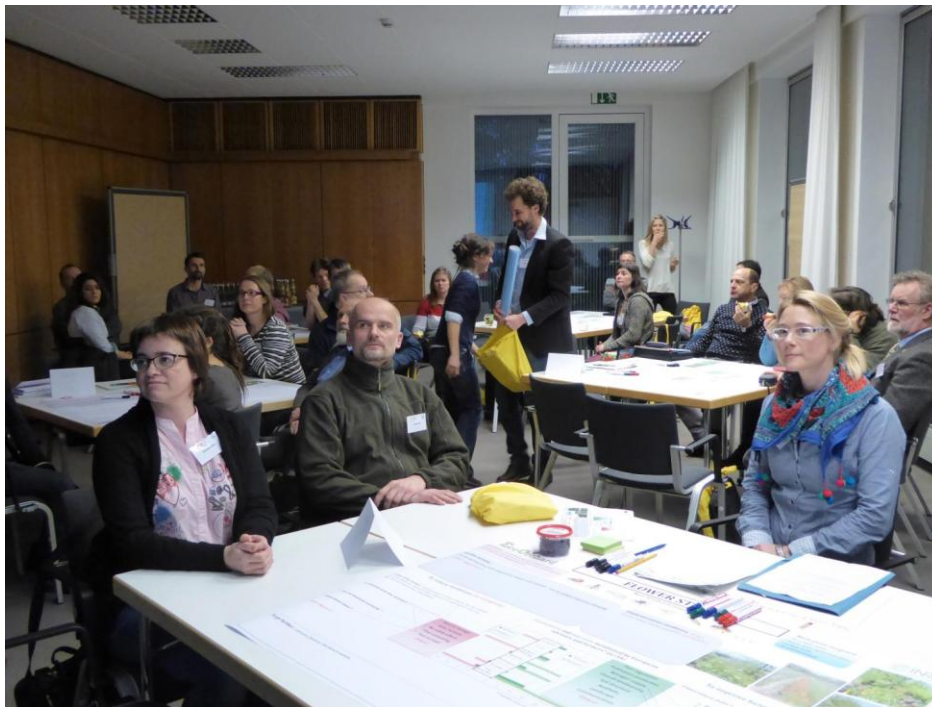
Workshop: Enhancement of Functional Biodiversity, 17th ecofruit-conference, 16.02.16