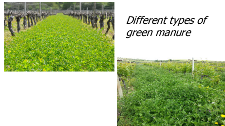
Different types of green manure