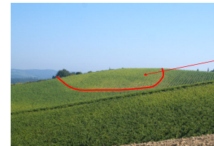
Degraded area within vineyard