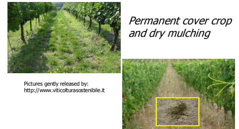
Permanent cover crop and dry mulching