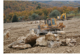
Land preparation for planting a vineyard in Italy

In both conventional and organic European vineyards, it is not uncommon to have areas characterized by problems in vine health, grape production and quality. These problems are very often related to sub-optimal soil functionality, caused by an improper land preparation before vine plantation and/or management. Different causes for soil malfunctioning can include: poor organic matter content and plant nutrient availability (both major and trace elements); imbalance of some element ratios (Ca/Mg, K/Mg, P/Fe, and Fe/Mn); pH; water deficiency; soil compaction and/or scarce oxygenation.