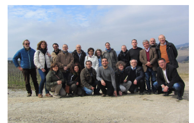
The group at the kick-off meeting