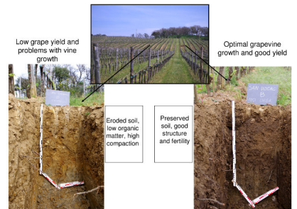
Low grape yield and problems with vine growth

The second result from the project is setting a comprehensive protocol of analyses and measurements for vineyard ecosystemic functioning assessment, tuned to European vineyard conditions.