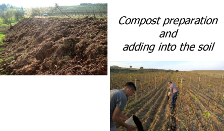
Compost preparation and adding into the soil