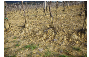
Roots exposed because of soil erosion