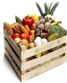
Example of Kolonihagen “Family Box” consisting of Bread, fruit and vegetables.

Kolonihagen is a box-scheme arrangement based in the Oslo region of Norway aimed at private households and companies. It was established in 2004 based on “enthusiasm” for the taste, quality and range of products of organic food compared to conventional food. It started as a home based company packing fruit and vegetable-boxes, but grew steadily - and in 2012 it also started distributing dinner boxes. Dinner -boxes are now the most important product- and count for 50% of the total turnover of Kolonihagen. Kolonihagen box schemes sold about 1200 boxes in March 2014, (1000 private, 200 business), 400 of which were dinner boxes. In January 2015, about 1700 boxes were sold each week. Kolonihagen also started its own bakery