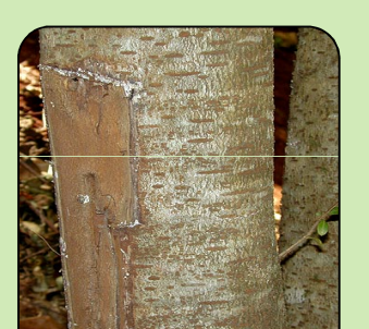
Warburgia tree with removed bark