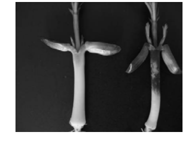
Fig. 1. The peanut AnM cultivation (left) and color changes (right) after hypocotyl exposing.