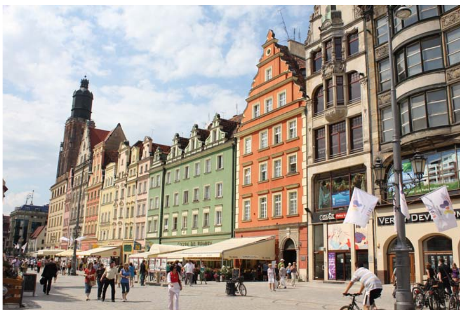
Image 4: An esplanade of Wrocław’s restored central market square (Rynek we Wrocławiu) displaying European City of Culture 2016 flags.

For the duration of the siege of Breslau, Koberwitz was beyond the ring of encirclement and appears to have been spared the onslaught. And the Breslau school, venue of Steiner’s karma course, also survived. The post-war restoration of Wrocław (pronounced ‘vrots-warff’) was the work of decades. In the sixties, the aftermath of Festung Breslau was still prominently visible with mounds of rubble in the streets and war-trashed buildings.