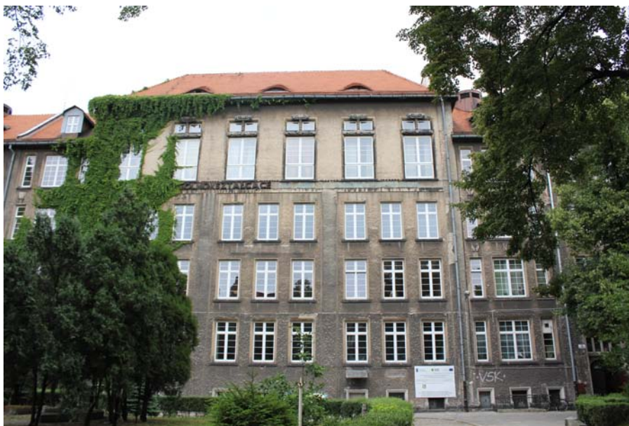
Image 2: Viktoria School (now Liceum Ogólnokształcące Nr 1) was the venue for Steiner's Breslau lectures.