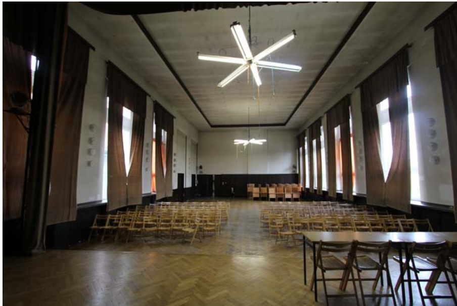
Image 1: Steiner's karma lectures were delivered in the lecture hall on the fourth floor of Viktoria School (now Liceum Ogólnokształcące Nr 1).

Since the participants could not all stay overnight in Koberwitz, people had to come out from Breslau and usually arrived around eleven in the morning. Then the lecture began and lasted until around one o'clock, after which came the midday meal ... After this there was still a discussion on agricultural subjects which lasted until three o'clock. That was the Koberwitz side of the event (1924a, p.2).