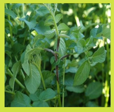
Figure 1: Stem blight

The main cause for stem blight is the latent infestation of seed tubers with Phytophthora infestans.