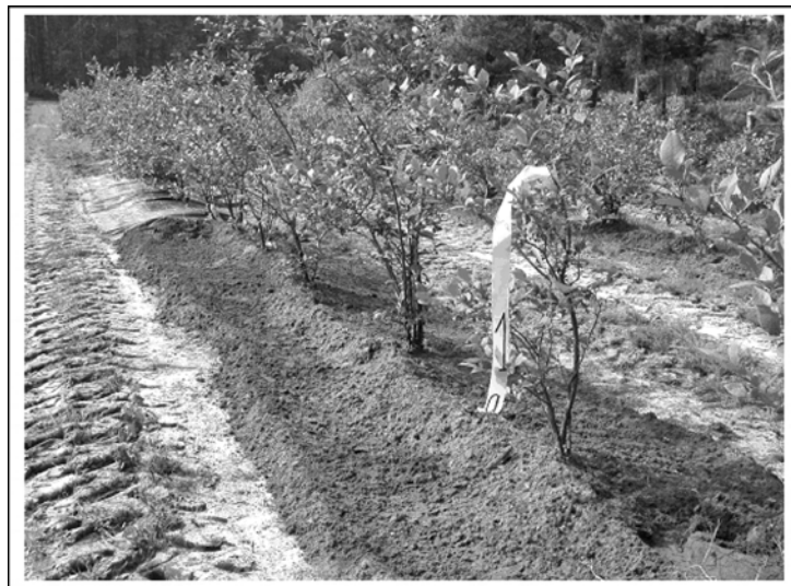
Figure 1: Arrangement of blueberry bushes on the experimental plot.