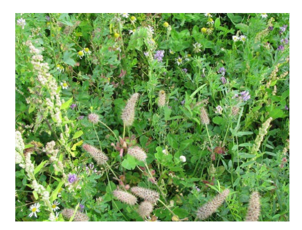
Figure 1: 'All species mix' of 14 legumes