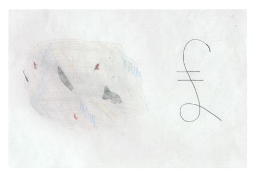
Fig. "Soil is a living community" and "Soil is the farmer's capital". How two participants drew and explained their images of soil when exploring their personal "notion of soil".

The workshop, in addition to other "living soil" activities, has been further developed and used in Norwegian schools in mid Norway as an introduction to the theme of sustainable soil management.