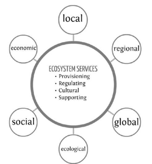
Figure 1: Ecosystem services, including their spatial scales and agro-ecosystem impact indicators (illustration: Pohl)

The filtering, buffering, and transformation function of soils (Figure 2; Blum, 1998) regulates and supports ecosystem services like nitrogen fixation, erosion control, soil conservation, soil formation and nutrient cycling.