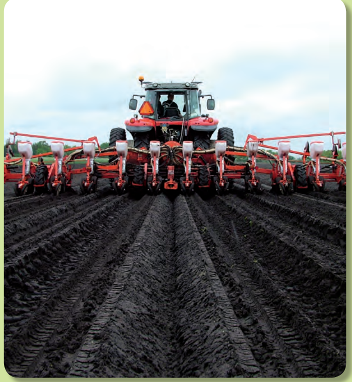
6 Research and development strategy 2012

The research and development of resilient systems should also provide fundamental knowledge on how to boost ecological support functions such as soil fertility and performance, functional biodiversity and regulation of livestock diseases while reducing the risks of long-term problems such as perennial weeds, pests and diseases. Generally, there is a need for more knowledge about how interactions between organisms above and below ground can be used innovatively to increase resilience in agriculture and aquaculture.