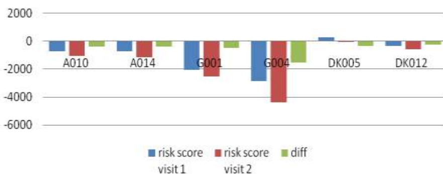
Figure 1+2+3 shows the risk scores on the y-axis and the different farms on the x-axis. The green column shows the difference (Diff) between risk score at the initial farm visit (blue column) and risk score at the final farm visit (red column). If Diff is negative, the farm has improved the management according to the HACCP tool, since a negative difference indicates a reduction in risk.