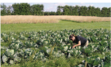
Photo 4 (left): Cabbage with intercropped strips of green manure in the organic system O3 showed the most significant decrease in egg laying by cabbage root flies over the three year study period. Egg numbers were estimated from soil samples collected around the cabbage plant.

crevices in the soil where the fly eggs are located.