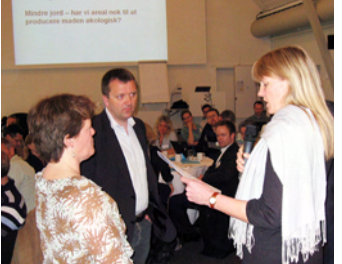
Discussions during the scenario games.

ding to their role in the sector (farmers, processors, wholesalers, retailers, investors, consumers and trade organisations). There were first introduced to the idea of scenarios, the scenario game and their part in the game. Their role was to "act themselves" in the year 2020, and try to figure out and explain how they as farmer, buyer, consumer, etc. would react in the organic market that was described in the scenario.