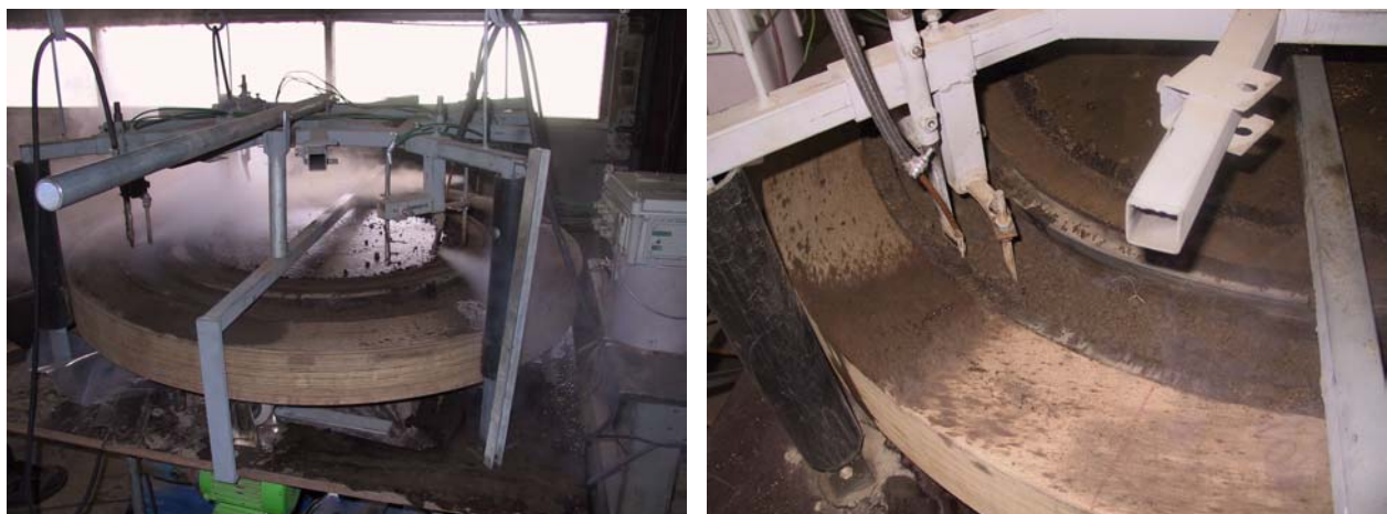
Figure 1. A circular groove for band-steaming in the laboratory

Two investigations were conducted in the laboratory, where soil steaming took place in a 7 x 8 cm circular groove made in a wooden wheel with insulation in the bottom and at the sides (Fig. 1). Soil was steamed by a timed flow of steam through rubber tubes, each connected to a line with two 1.5 mm holes. Four steam generators with a total effect of 8 kW produced steam. A total of eight lines were placed so that the soil volume in the groove was steamed evenly. The soil temperature was continuously measured by eighth thermocouples placed evenly in the soil while steaming and in a short period after steaming had been stopped. The soil was collected from a sandy loam expected to contain many natural weed seeds of different species. Samples were collected in October 2000 for the first experiment and March 2001 for the second one. In the second experiment, seeds of oil seed rape ( Brassica napus ) and ryegrass ( Lolium perenne ) were added to the samples prior to steaming. Steaming took place a few days after soil samples had been collected from the field. After steaming, half of the soil fractions were chilled at 5°C for 30 days in order to break seed dormancy. Both chilled and non-chilled soil fractions were germinated for 6 weeks in watered trays in the glass house, and weed seedling emergence was registered regularly on species level in the germination period. Each treatment was replicated three times.