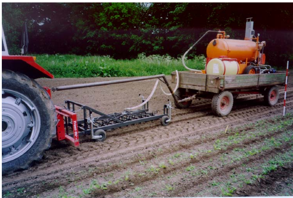
Figure 3. A prototype band-steamer with a 200kW steam generator. Thirteen steaming tines are placed along a 7-cm wide line on the towed frame that is mounted to the 3-point linkage of the tractor.

different: Capsella bursa-pastoris 70°C; Chenopodium album 65°C; Tripleurospermum inodorum , Polygonum spp. and grass weeds 60°C; ryegrass and rape 75°C. Chilling generally lowered seedling emergence of all the weed and crop species in the untreated trays and in those where the maximum temperature did not exceed 40 °C, probably because chilling caused non-dormant seeds to become dormant. However, the opposite was true for Polygonum spp. in the soil collected in the autumn 2000, where chilling had broken dormancy of the majority of the seeds, and thus more seedlings emerged in the chilled fractions. The lethal effect of steaming on dormant Polygonum spp. seeds was, however, similar to that found for the non-dormant weed species.