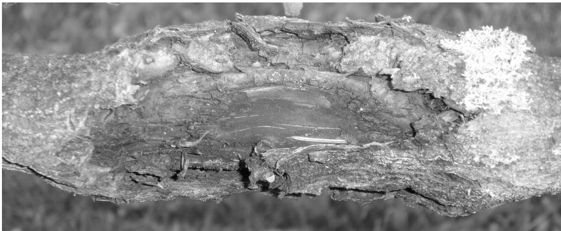
Fig. 2. Typical apple canker caused by Nectria galligena . The canker is partial and open, i.e. an area of bare wood is surrounded by callus-like host tissue.

We are currently examining the possibility of endophytism in N. galligena . If this feature turns out to be common, there will be obvious implications for the control of endophytic N. galligena infections in nurseries, especially in organic management practices where systemic fungicides cannot be used.