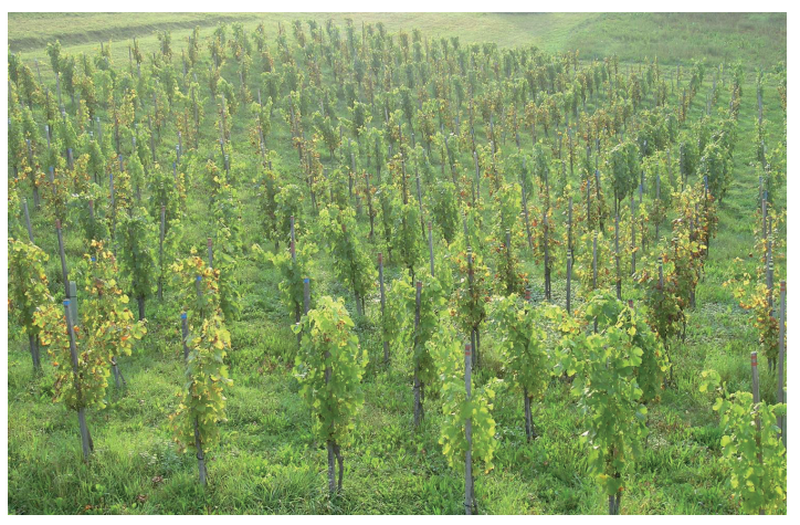
Figure 2. Overview of the screening vineyard on 19th August 2005.

The work is funded by the European Commission (Project 501542 REPCO).