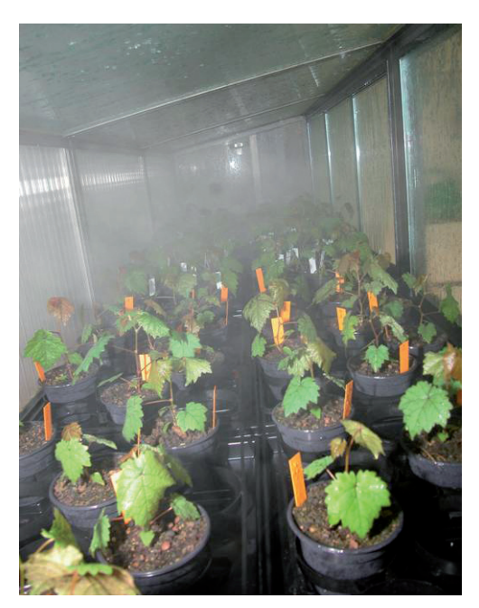
Figure 1. Incubation of grapevine seedlings for efficacy testing of novel plant protection products (indoor screening).

The field experiments were carried out in a screening vineyard in a randomized block design (Fig. 2). The test products and reference treatments were deployed weekly. The plants were treated with an air assisted knapsack sprayer until near run-off. During the growing season, visual disease scoring was carried out several times by recording disease incidence and disease severity. The experiments were carried out following the relevant EPPO guidelines.