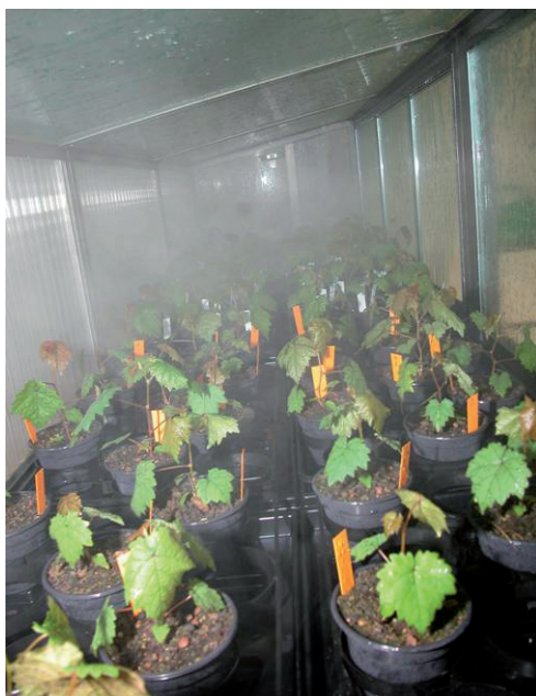
Figure 1. Incubation of grapevine seedlings for efficacy testing of novel plant protection products (indoor screening).

Testing products in the lab and in the field is an efficient method for identification of novel candidate products. Within the framework of the EU-funded project "REPCO" a new series of promising products will be tested under controlled conditions and in the field in the 2006/7 season.