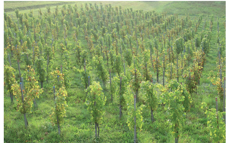
Figure 2. Overview of the screening vineyard on 19 th August 2005.

The field experiments were carried out in a screening vineyard in a randomized block design (Fig. 2). The test products and reference treatments were deployed weekly. The plants were treated with an air assisted knapsack sprayer until near run-off. During the growing season, visual disease scoring was carried out several times by recording disease incidence and disease severity. The experiments were carried out following the relevant EPPO guidelines.