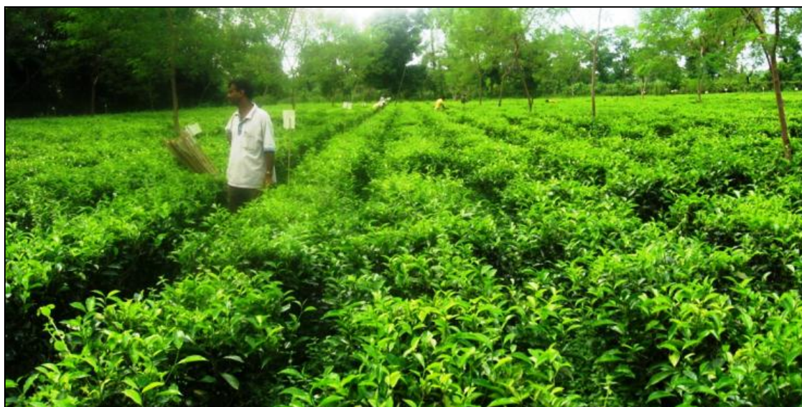
Fig. 1: Organic Young Tea Management at Maud Tea Estate, Assam, India.

effectiveness under new plantation experiment. Experiment was laid out as per randomized block design (RBD) with eight treatments and three replications (Figure 2). Effectiveness of the different packages was evaluated in terms of yield achieved over control, year wise yield progression towards meeting the target and finally economic viability.