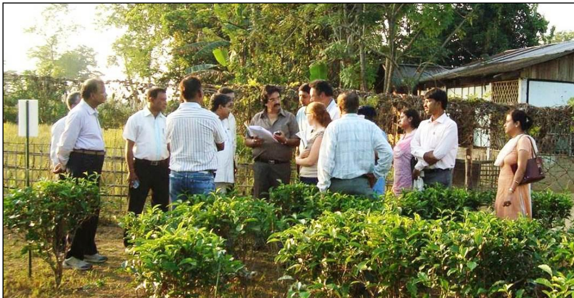
Fig. 5: Visit of FAO-CFC-TBI team, Scientists and Advisory Board Members of Inhana Organic Research Foundation along with Tea Research Association scientists at study area in Maud Tea Estate.