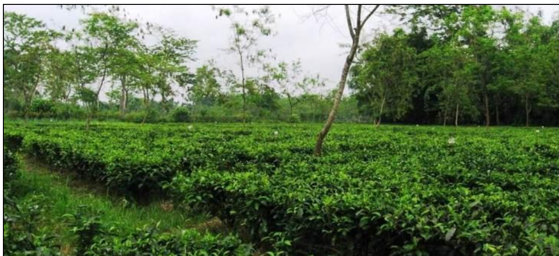
Fig. 4: View of Young Tea Plantation Selected for Experiment under FAO-CFC-TBI Project at Maud T.E., Assam.

Note: Quantity of soil inputs under different POP were calculated on plant- N requirement basis i.e. for giving 60kg N, except for the soil inputs which had fixed recommended dosage like BF, BD and FYM-2. Actual dosage was calculated based on N and moisture percent in the soil input. Novcom compost was applied in combination with 40 kg Elemental-S and 80 kg Rock phosphate per hectare. In case of soil mgt. using Biodynamic compost, CPP @ 12.5 kg/ ha and Cow horn manure (15 ltr. soln/ ha) was also used. Pruning: UP - FFP - UP; Bush Population: 7065/ha; Age: 3 - 5 years; VCR was calculated considering Made tea @ Rs. 200/kg.