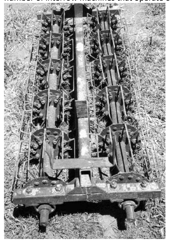
Figure 6. Basket weeder

While interrow hoes have been used successfully for many years they have a number of limitations. They have difficulty dealing with surface trash and tend to block up, they do not work well in stony conditions, they need a dryish soil to work well and clog up in damp soil. There are an increasing number of interrow machines that operate on different principles.