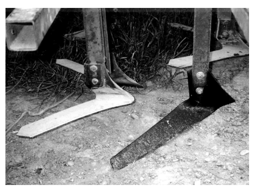
Figure 4. Poorly designed hoe blades

While interrow hoes have been used successfully for many years they have a number of limitations. They have difficulty dealing with surface trash and tend to block up, they do not work well in stony conditions, they need a dryish soil to work well and clog up in damp soil. There are an increasing number of interrow machines that operate on different principles.