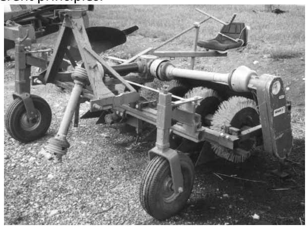
Figure 5. Horizontal axis brush hoe