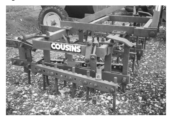
Figure 10. Potato weeder