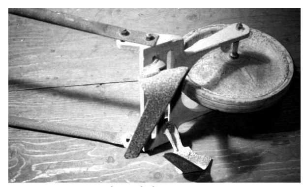
Figure 11. Hand push hoe

There are a wide number of other interrow machines available. These are often made by a single manufacturer and have limited availability. Examples include; spyders™ a cross between a concave disk and a single spider from a rolling cultivator, torsion weeders which consist of a spring steel rod designed to break up the soil (and therefore kill weeds) in the crop row (Figure 9), and finger weeders that consist of a number of rubber 'fingers' mounted on a cone wheel that weeds in-between crop plants. The lack of widespread take up of such machines is an indication that there are problems with their efficacy or economics, however many of the growers that use them consider them to be good machines. It is recommend that producers, especially those new to organics, purchase well proven and widely available machines before considering more unusual weeders.