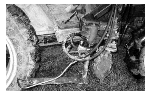
Figure 12. Perennial crop weeder