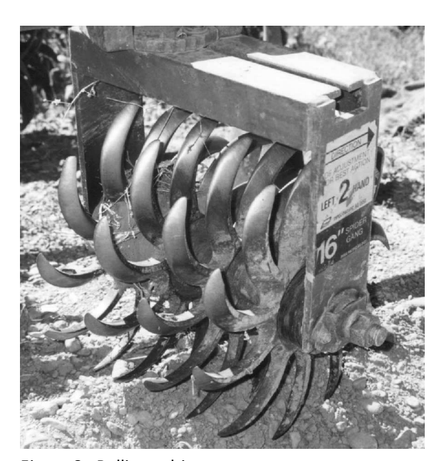
Figure 8. Rolling cultivators