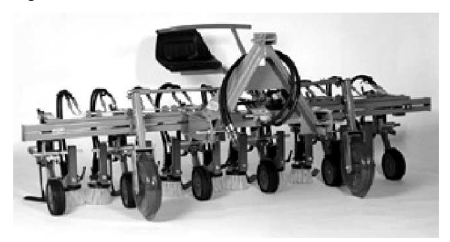
Figure 7. Vertical axis brush hoe