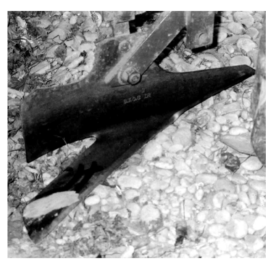
Figure 3. Well designed hoe blade

hoe in Figure 4 has a short downward pointing front edge which is better at dealing with trash than the left-hand one but not as effective as the hoe in Figure 3. Its blade is angled sharply up from the horizontal making it more difficult for the soil to flow over it, so it tends to flow along the blade instead. However the backwards angle is more shallow which means soil tends to want to flow over it rather than along. It is also more strongly constructed than the left hand hoe. The right-hand hoe in Figure 4 is better suited to large robust crops such as maize or sweetcorn where depositing 1-2 cm of soil in the row will not damage such a crops but will bury small weed seedlings therefore killing them. Different types of hoes suit different crops.