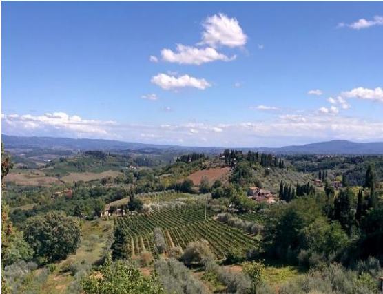
Fig. 2: Landscape view of Montepaldi Long Term Experiment (MoLTE). Semi-natural habitats contribute to the beauty of the landscape and biodiversity of the experimental site .

between samples indicates a positive action by predators over the whole period, even far from the margins, and in the conventional system.