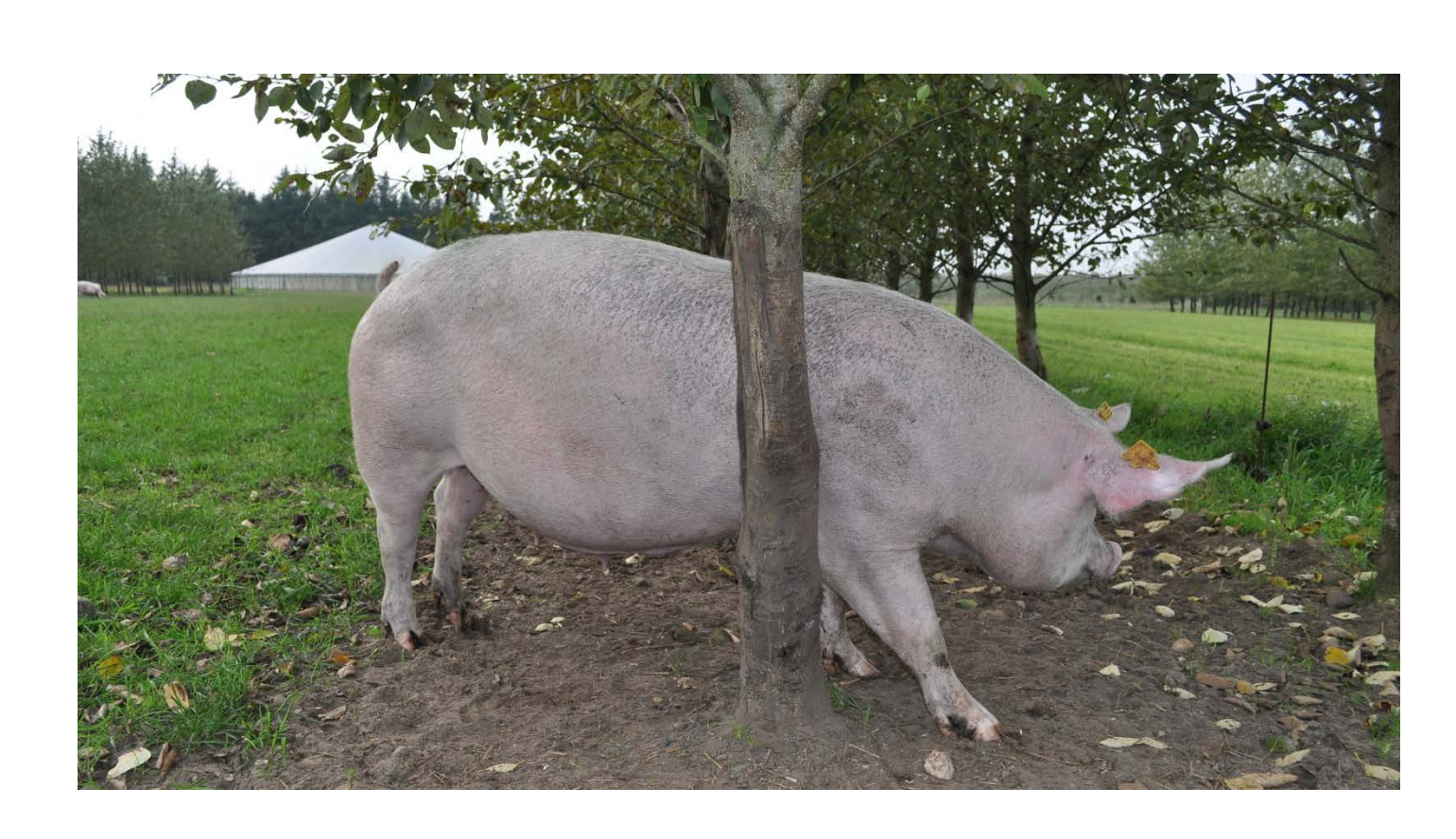
AGFORWARD: www.agforward.eu pECOSYSTEM: http://agro.au.dk/forskning/projekter/pecosystem