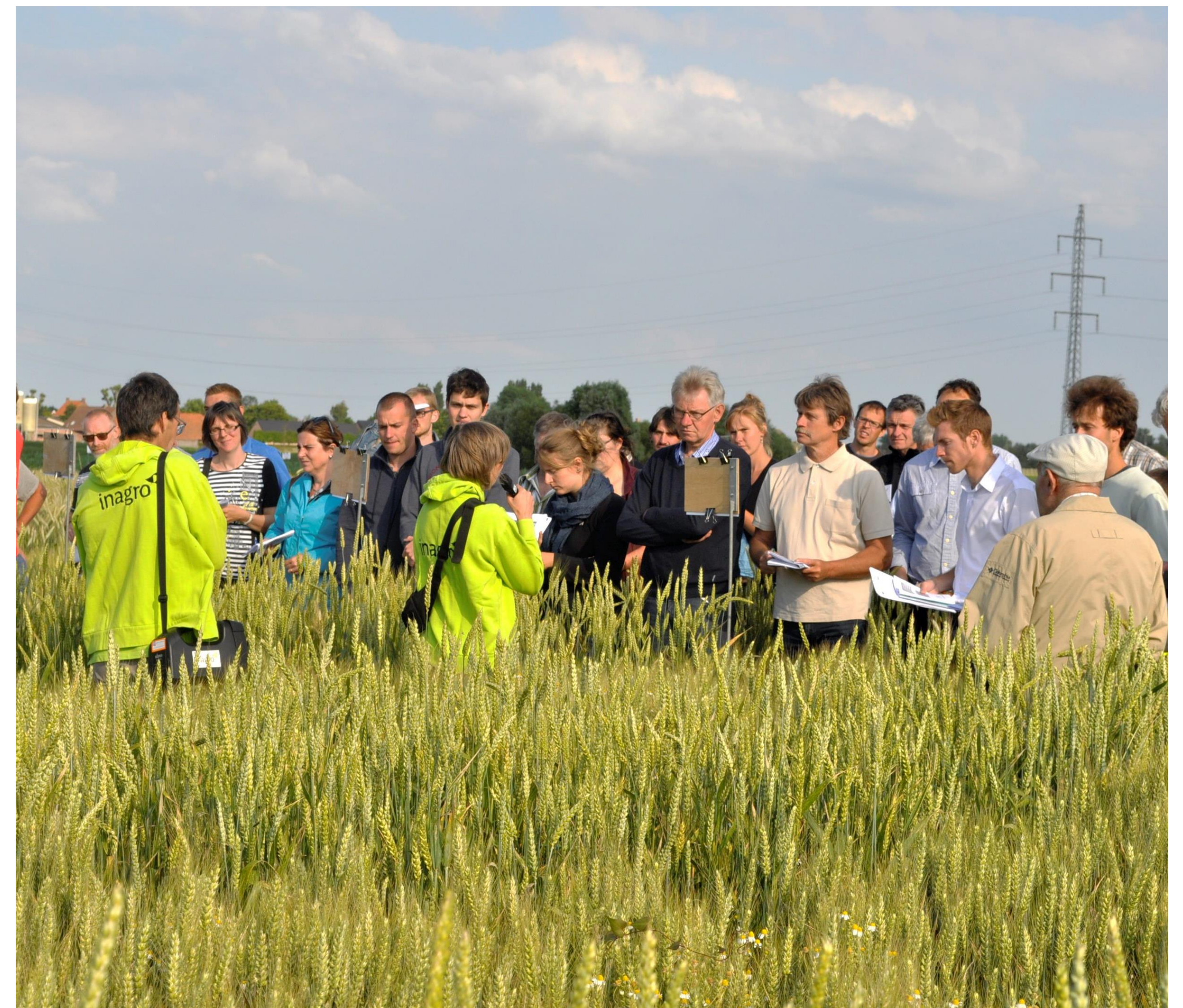
Figure 1. Farmers get to know CCP's (June 2014)

Interested farmers; legal framework not adapted