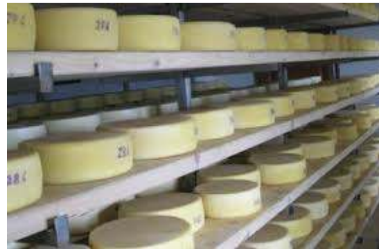
Inside the Planika dairy

Planika dairy has long history that dates back to 1957. The present structure of the company as a limited liability company (LLC) dates back to 1995, and was established by the Tolmin agricultural cooperative. The company's raw material (milk) comes exclusively from 120-130 (from year to year) local mountain farms in the North and North-Western regions of Slovenia, especially the Tolmin, Kobarid, and Idrija regions.