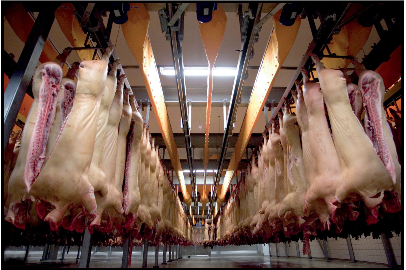
Danish Crown svineslagteri, Horsens Nord - Foto: © copyright Claus Sjödin 2005 / www.claussjodin.com

Restrictive use of antibiotics in organic animal farming – a potential for safer, high quality products with less antibiotic resistant bacteria