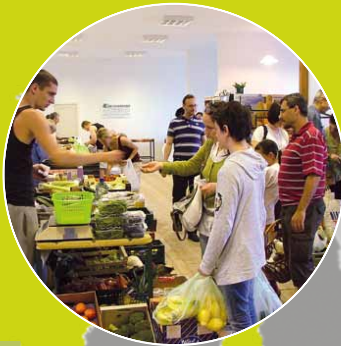
Weekly organic market in Újpest, Budapest.