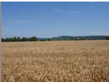
An organic wheat field in western Hungary.

(%) for food characteristics (Fürediné Kovács, A. 2006).