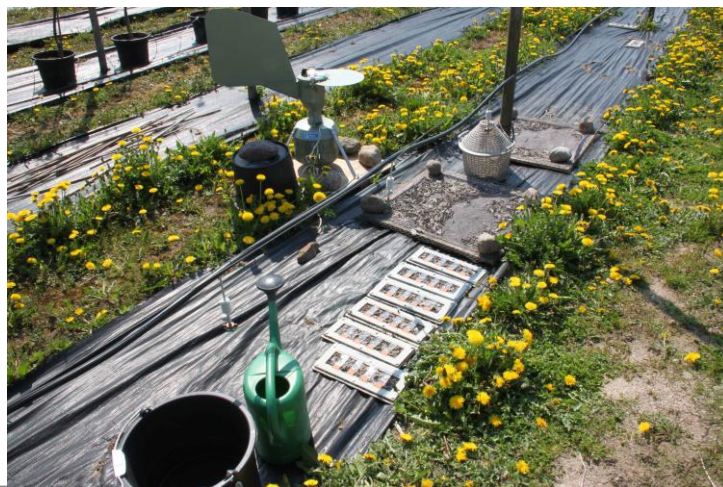
Figure 4: Equipment for measuring discharge of ascospores in relation to irrigation with different sizes of drops. Two spore traps are used: Slideholders and a Burkard volumetric spore trap.

The high infection level of scab in the orchard Kysøko might be explained by overwintering conidia spores in the buds. Conidia spores can be found in winter buds, when the scab infection level in the previous autumn exceeded 40 %. (Holb et al.2005) That was the case in the orchard Kysøko in 2011, where the infection level was above 59% in Sept. 2011. Infections by conidiospores from the buds cannot be prevented by strategic irrigation on the orchard floor. Conidiospores in buds also lower the certainty of Scab warning programmes.