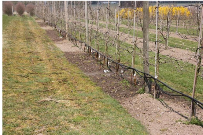
Figure 2: The experiment in Taastrup. The sprinklers are SpinNet micros sprinklers, model 160 sprinkling only on the ground.

At the University of Copenhagen, at the location in Taastrup, more investigations were carried out in 2012 and 2013. The discharge of ascospores was observed in different types of spore traps to study the ascospore reaction to irrigation compared to rainfall. Different types of irrigation was tested: watercan (big drops), sprinkler (medium drops) atomizer (small drops), rainwater contra tapwater and also sound impact.