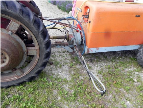
Figure 1: The waterwagon from the orchard Harndrup. It is a resused mistsprayer, where the pump was geared up. Mounted with a bar with sprinklers