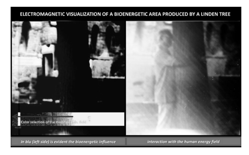
Fig.3 Electromagnetic visualization of a Bioenergetic influence by a Linden Tree made by "Futura" device