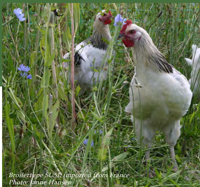
Broilertype SU51, imported from France.