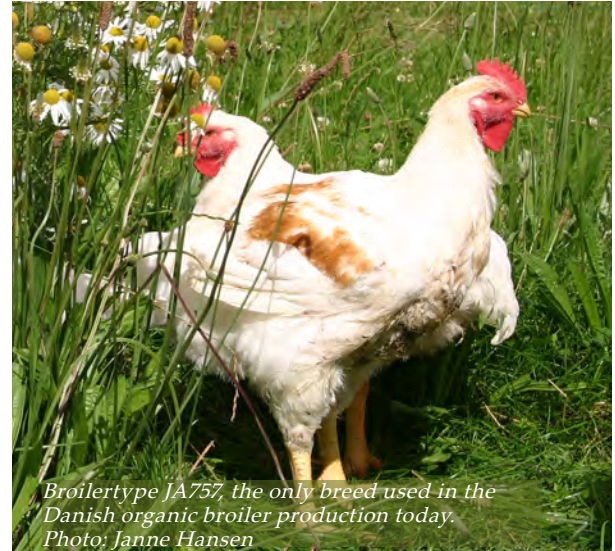
Broilertype JA757, the only breed used in the Danish organic broiler production today.

The results so far indicate that it is necessary to use chicken genotypes with lower growth rates for a better welfare, and the focus should be on the individual genotype and its actual nutrient requirements and utilisation of feed from the range area.