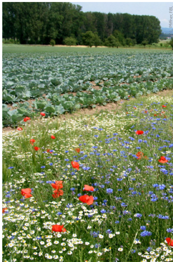
Flower strip besides a cabbage field which provides habitat for beneficial organisms, essential for pollination and disease and pest control of crop plants.

Several key inferences can be made regarding agriculture, based in this understanding of the effects of climate change. As formulated in Müller et al., (2012, p104) , for example, "First, impacts vary strongly per region. [...] Second, water will be a key issue, in particular due to water scarcity and drought, but also because of extreme precipitation events, waterlogging