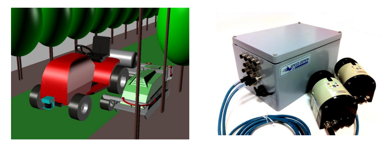
Figure 1: Left: Illustration of domain in which the FroboBox system is used the control the ASuBot equipped with a prototype natural gas burner from EnvoDan ApS (<u>www.envodan.dk</u>) for weeding with orchards. Right: The FroboBox prototype.