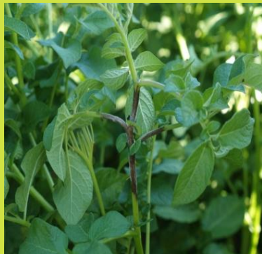
Figure 1: Stem blight