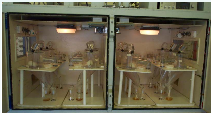
Figure 1. Rats in respiration chamber for measurement of activity and heat production.