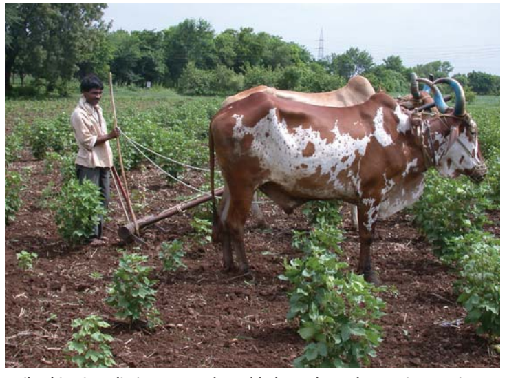
Soil cultivation eliminates weeds and helps to keep the precious moisture in the soil.

Is organic cotton a sustainable alternative for rural development? The experience of "Maikaal", India, suggests that cotton production can be done in a socially, ecologically and economically sustainable way. An increasing number of farmers of the region are getting engaged in organic farming methods, and many are adapting the promoted low cost drip irrigation systems. At the same time, a number of questions arise which are to be answered before the Maikaal approach can be promoted as a model for replication.