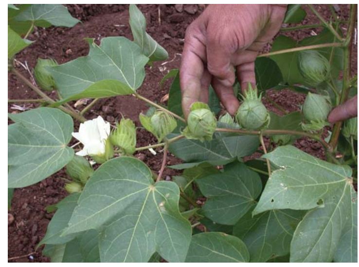
Flowers and forming pods at an organic cotton plant.