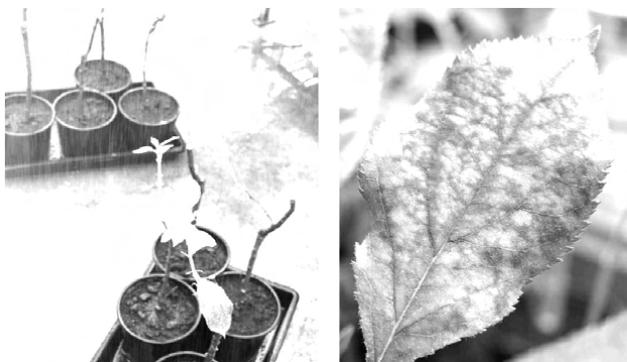
Figure 1: Efficiency test in the greenhouse. Left: Application of test preparations to apple shoots during the germination period under simulated rainfall. Right: Untreated apple leaf 20 days after inoculation. Approximately 60% of the leaf surface is covered with sporulating scab lesions.

Efficacy test. Five to ten leaves with conidia of V. inaequalis were thawed and shaken in tap water to obtain conidial suspensions. The three youngest completely unfolded leaves of the apple shoots were spray inoculated with 1 \times 10^5 conidia/ml until runoff and subsequently incubated at 18°C and 100% relative humidity for 20 h in the dark. The plants were subsequently kept under greenhouse conditions as described above. Test preparations were applied with the appropriate concentration either protective (2 hours before inoculation), during germination (5 hours after inoculation on wet leaves or 5 hours after inoculation during simulated rainfall) or curative (24 hours after inoculation on wet or dry leaves). Rainfall was simulated in the greenhouse (fig. 1) with a spray nozzle placed 2 m above the plants and the sprayed water quantity was measured with a pluviometer. 5 to 10 l water /m 2 were applied in 15 min.