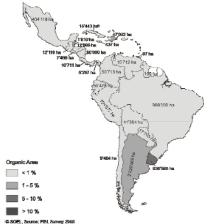
Map 4: Organic farming in Latin America 2006