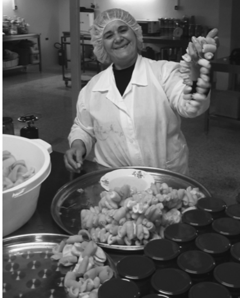
Picture 3: Lebanese consumers are quality-conscious and sensitive to regional provenance. The organic market initiative 'Wadi El Tayim' is a women's cooperative that produces Lebanese specialties using artisan processing techniques. Their main markets are Arab communities abroad, familiar with the much-valued Lebanese cuisine.

Certified organic products provide access to attractive local and international markets for developing countries, while the producers generate higher incomes. In addition, due to long-term contracts, income is generated more continuously than in conventional trade: To guarantee a fair share of the international organic trade benefit to those contributing most to the production of food, trade must include social regulations. For this reason, numerous organic products in developing countries also embrace social standards in accordance with fair trade labels such as 'Max Havelaar' or 'Transfair'.