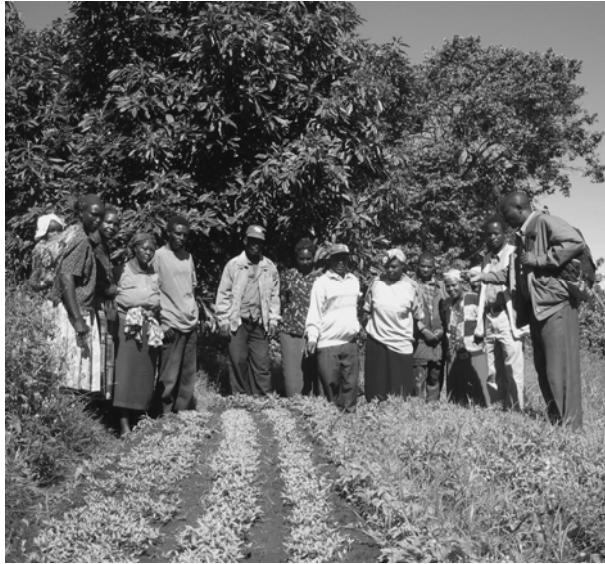
Picture 1: Organic farmers from Karatinga (Kenya) discussing their experiences with organic farming in a pepper nursery. These pioneers in organic farming in Africa are important partners of the network of long-term farming systems comparisons in the tropics. Participatory on-station and on-farm research generates new knowledge that is shared with other farmers. Such learning processes lead to sustainable innovation.