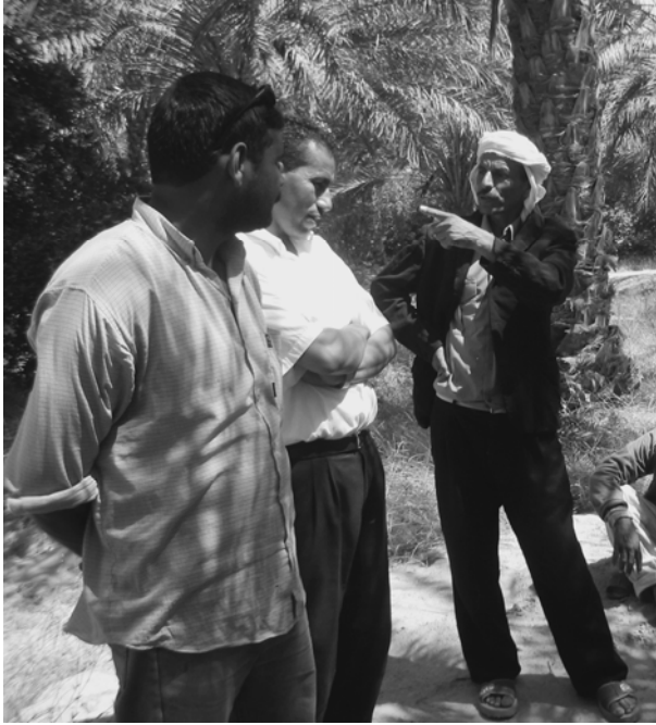
Picture 2: Organic farmers in the tropics promote the balance between growth, decomposition and mineralization. Organically managed soils have a high potential to counteract soil degradation, as they are more resilient both to water stress and to nutrient loss. In the picture: Organic farmers from Hazoua (Tunisia) discussing strategies to reduce water evaporation of the soil.

Fortunately, in the humid tropics, it is not only decomposition processes that are rapid, but also composition processes. Animal manure, green manure and compost favor the composition processes and can replenish nutrients required by crops and supply the soil with essential organic matter. Additionally, legume plants are a highly valuable source of nitrogen. Closed nutrient cycles and efficient use of local resources – for example compost, dung or seeds – are especially important for subsistence farmers depending on few and limited assets. For this reason, organic agriculture means adapted technologies.