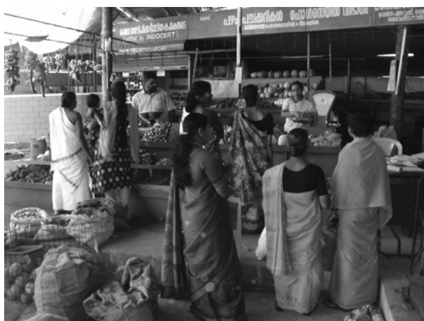
Picture 4: India is already exporting a range of organic products such as tea, spices, cotton, rice, etc. The Indian domestic market is promising, although still small.

Very often, conventional agriculture puts farmers in a situation of high dependency on agro-industry and its high-tech solutions, which are difficult to understand. Organic agriculture profoundly respects indigenous knowledge, women's knowledge and local solutions. Producers thus gain control over the production cycle and increase their self-confidence. Local and international organic producers play an active role in advancing their production methods and in developing standards.