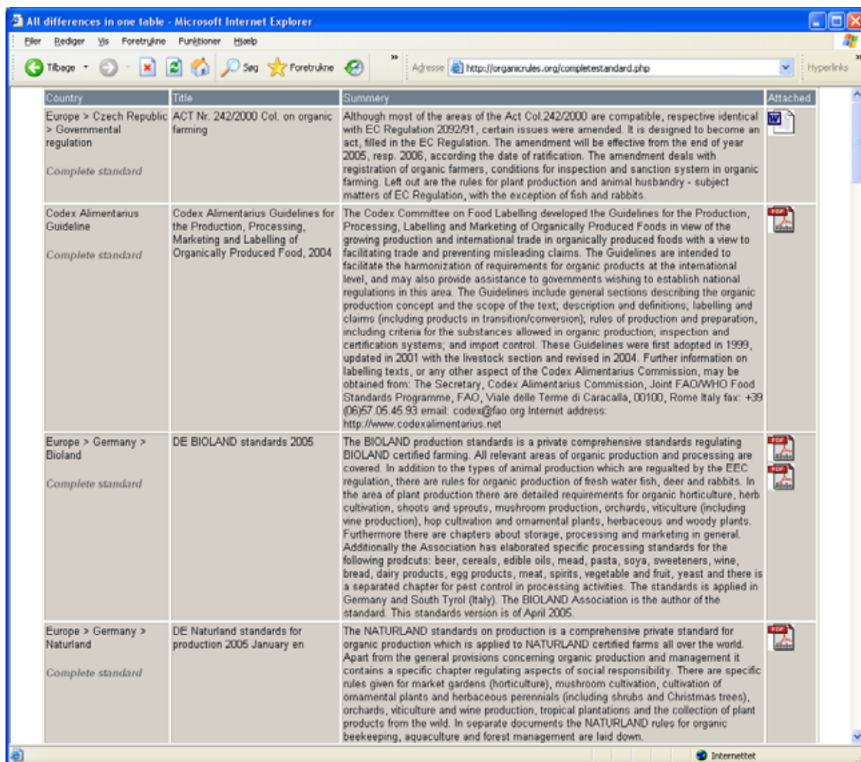
Figure 2-6. The view of the web page when “All complete standards in one table“ is selected (see Figure 2.1).

A short description of all the uploaded standards held by the database can be found here, and the full text in an attached file can be opened or downloaded.