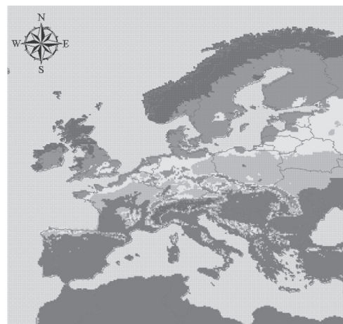
Thermal humidity index in July